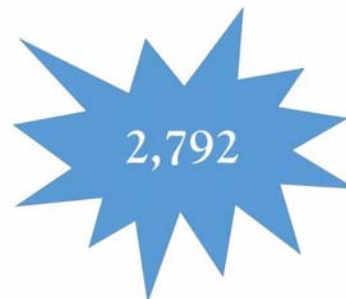
professionals trained to lead IHC workshops

to advance the quality of healthcare by optimizing the experience and process of healthcare communication.