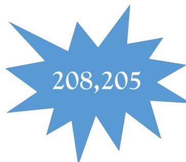
Participants in IHC workshops