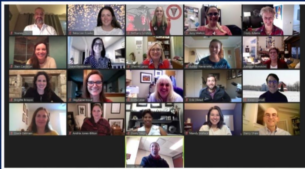
2020 IHC Veterinary Communication Project Faculty Course

We held our annual weeklong course December 7-11, 2020 with 16 new faculty members led by our very resilient senior trainers. It was a very positive experience which speaks to the flexibility and commitment of all. We experienced being as close to in-person as possible using the benefits of Zoom technology and the graciousness of our veterinary colleagues from across the United States and Canada and representing five time zones! The virtual format provides the same high level of engagement and customized learning using large and small group format that has been successfully used over the past eighteen years.